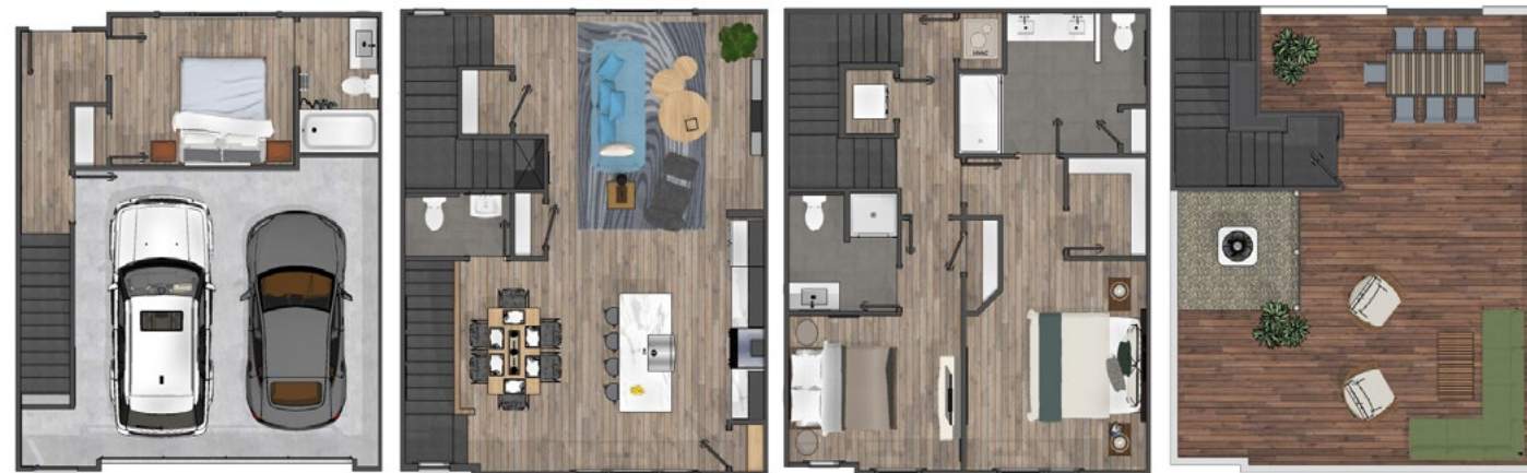
1,752 SQFT, 3 Bedrooms, 3.5 Baths, 2 Car Garage, 556 SQFT Rooftop Terrace