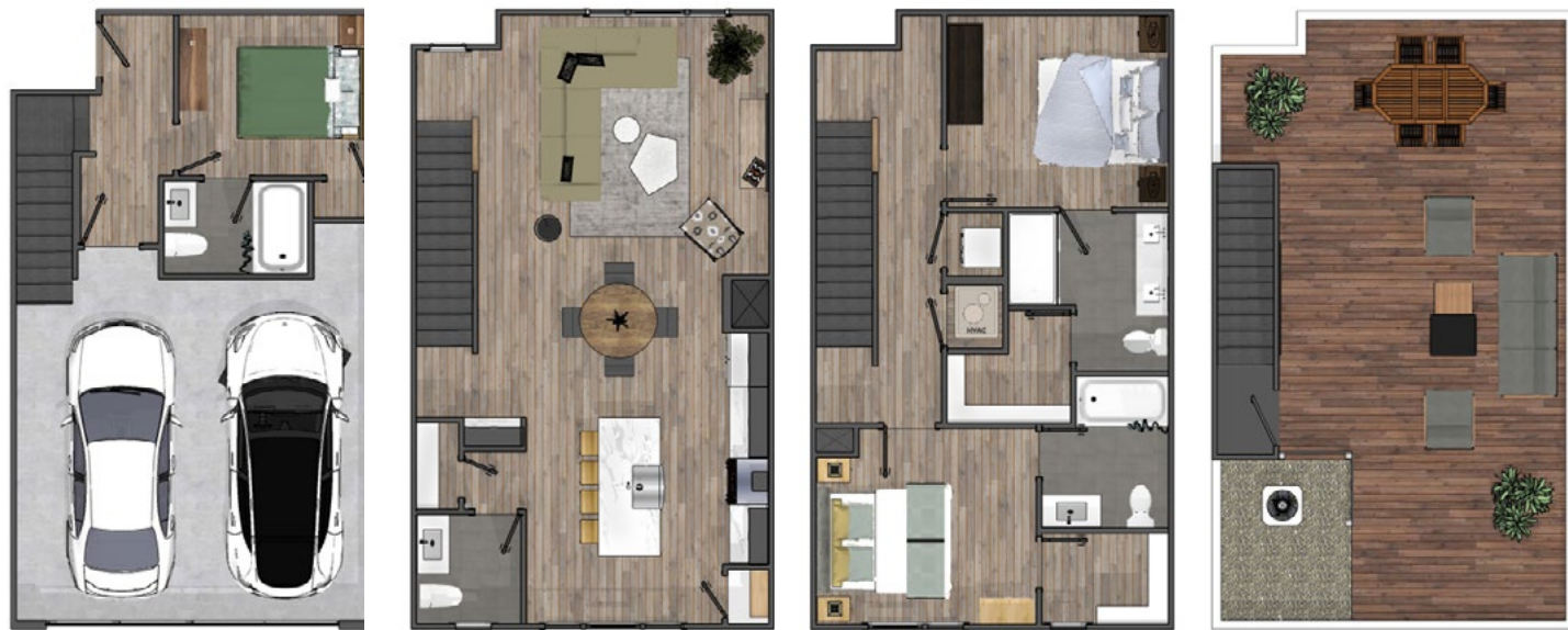
1,649 SQFT, 3 Bedrooms, 3.5 Baths, 2 Car Garage, 558 SQFT Rooftop Terrace