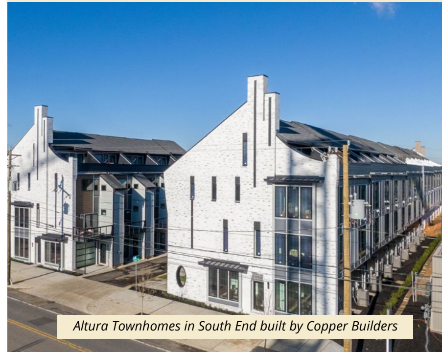
Altura Townhomes in South End built by Copper Builders