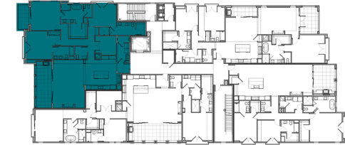
THIRD TO FOURTH FLOOR