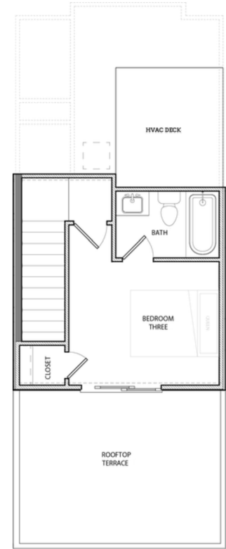
FOURTH FLOOR WITH TERRACE

*Terrace included in select homes; pricing varies based on plan and availability.